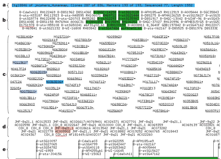
Figure 2 Example contig from the whole-genome BAC map. Portion of contig shown is localized to chromosomal region 8q21, composed of 836 BAC clones ordered by restriction fingerprint mapping. a , Contig summary information. Only 287 of the 836 clones are displayed. Redundant clones are 'buried' in their parent clones as indicated by the + and * clone name suffixes (see c ). The contig contains 193 markers; 77 clones have been selected for sequencing. Contig length: 1,552 unique restriction fragments (~ 6 Mb). b , Markers associated with clones in the display. Green: specifically associated with clone N0363E06 (aqua in c ). There are 69,507 markers currently in the database associated with clones, largely by ePCR. Only one marker of the 62 shown is inconsistent with the 8q21 localization of this contig (D17S978, red underline). This is probably not a unique marker in the genome as the clone with which it is associated also contains several chromosome 8 markers. c , Partial display of the contig, showing 112 of the 287 clones visible with this view. Blue, example clones selected for sequencing. These clones were believed to overlap as they shared several restriction fragments; overlaps have been confirmed by working draft sequence. d , Data associated with the clones in c . FISH data (for example JMF-8q21.1) is consistent, except for one clone (N005M18, 9q22, red

As the working draft sequence accumulated, known markers within the sequence were readily identified by electronic PCR (ePCR), a program that searches sequence for STSs by identifying the associated primer sequences in the correct orientation and with correct spacing 29 . These data were incorporated into the FPC